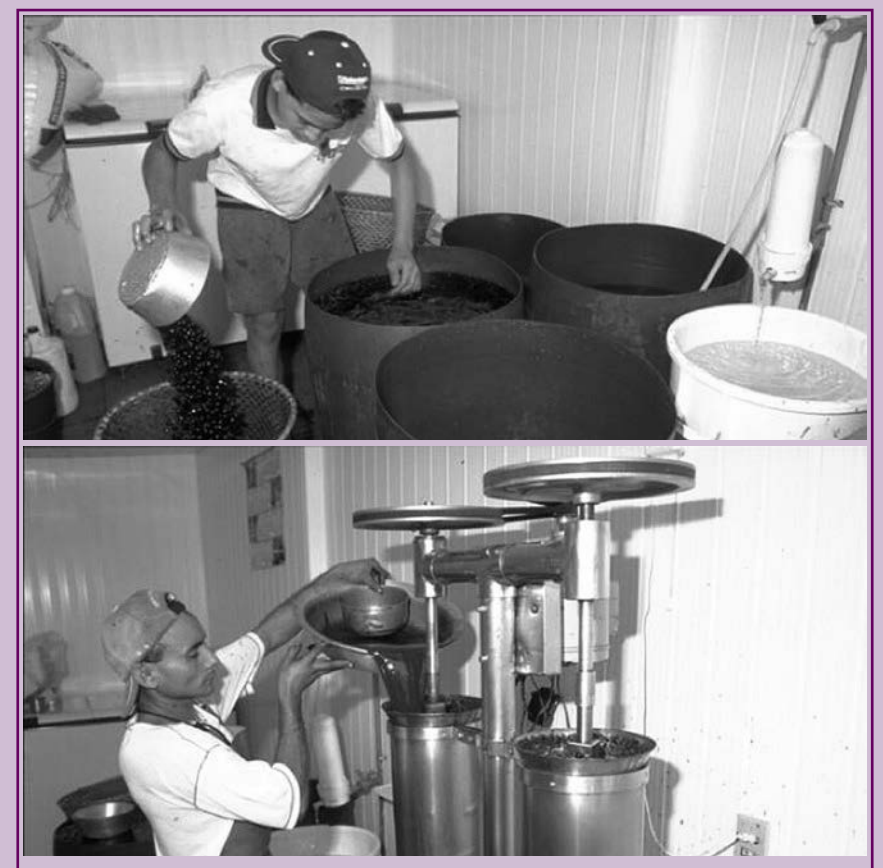
FIGURES 5 & 6 Processing assaí palm (Euterpe oleracea) wine ("vinho de açaí").

The assai or açaí fruit is highly valued throughout the Amazon, as a juice, or as a "wine" (which is not traditionally fermented!) The dark purple juice is an important and popular dietary complement, and is extracted from the small round fruit, after soaking the seeds in water to soften the thin outer shell. The seeds are then squeezed and strained to produce a tasty, dense purple liquid which is commonly served ice cold with sugar and tapioca flour. It is a nourishing and refreshing beverage: açaí berries are amongst the most nutritious foods of the Amazon, rich in B vitamins, minerals, fiber, protein and omega-3 fatty acids, and reported to harness antioxidant, antibacterial, and anti-inflammatory properties, and cardiovascular system benefits. Assai is considered to have the best nutritional value of any fruit on earth!