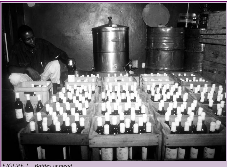
FIGURE 1 Bottles of mead

Toddy and palm wine are other alcoholic beverages made by fermenting the sugary sap from various palm plants – a process which is easy to do with the correct yeasts, temperature and processing conditions. Throughout the world, alcoholic drinks are made from the juices of locally grown plants