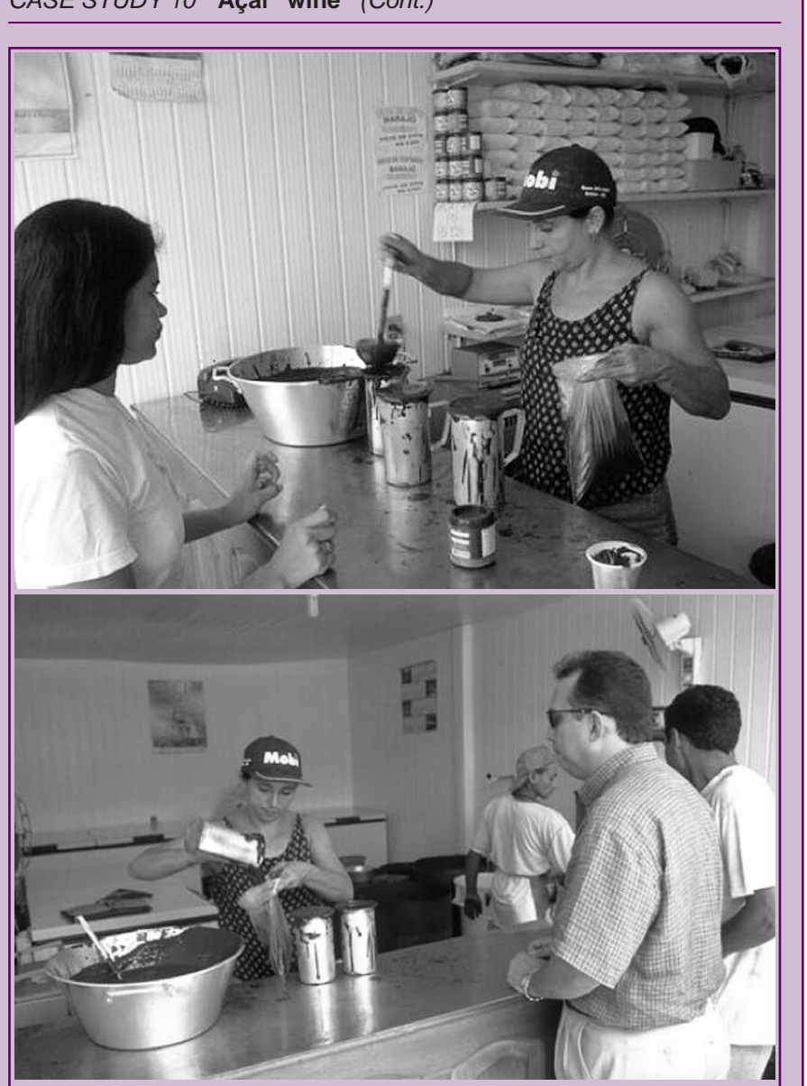
FIGURES 7 & 8 Selling assaí palm (Euterpe oleracea) wine ("vinho de açaí"). Brazil