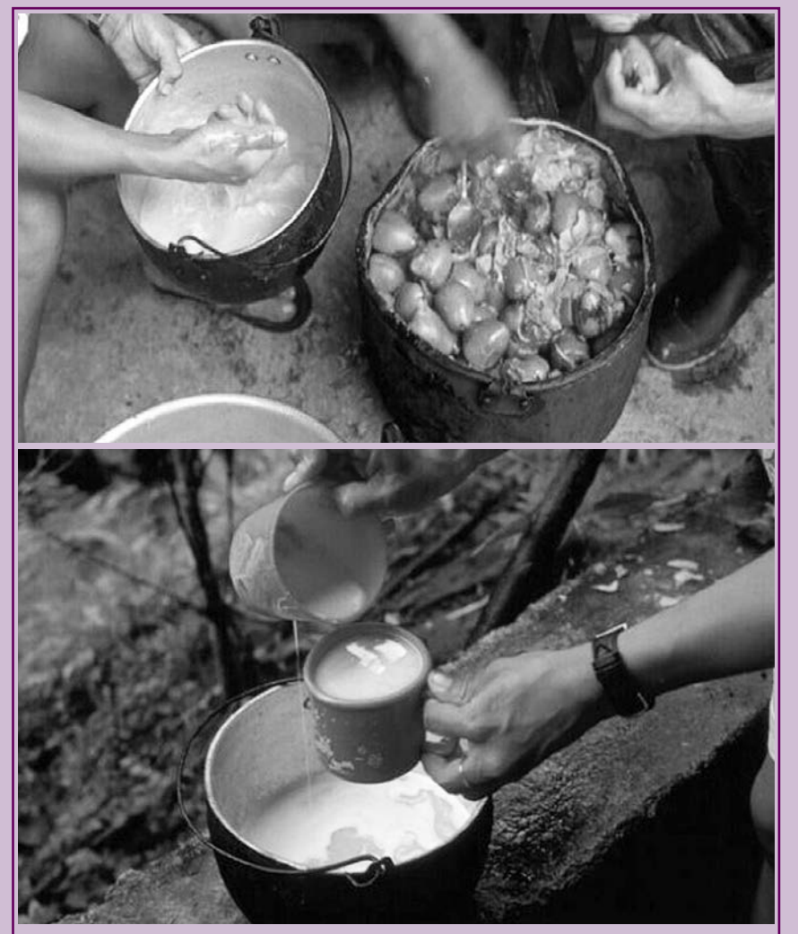
FIGURES 3 & 4 Preparing chicha, a locally produced fermented drink made from Bactris gasipaes fruit. Ecuador

was consumed mixed with water as a cool drink, and traditionally carried wrapped in leaves during journeys, then diluted in water.