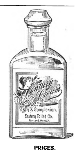
35c., 50c., $1.00.

it is just as pure and sweet as when first made. It never grows rancid or sour, or loses its pure white color. That is because it is pure,—because it contains only the purest ingredients — justifies its name — Century Cream.