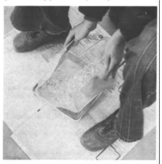
Fig. 9.1. Sieving ground barley through a window screen sieve.

Figure 9.1 illustrates sieving fine, dry barley meal and the smaller pieces of hulls from the coarser meal and the larger pieces. The sieve was a piece of window screen that measured inches before its sides were folded up and form an open-topped box.